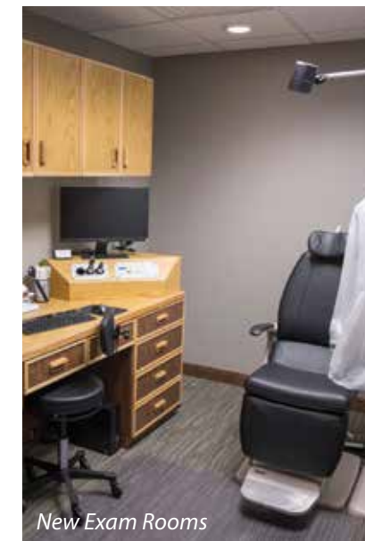
New Exam Rooms

Our goal is for you to enjoy your improved vision as well as the process that helped you achieve it. In fact, we've made some recent renovations designed to do just that!