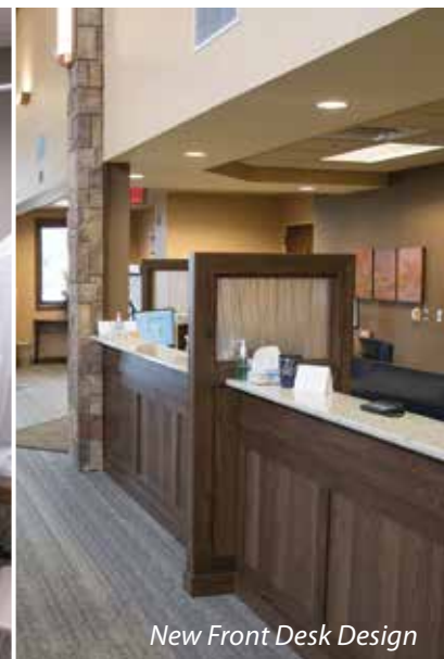
New Front Desk Design